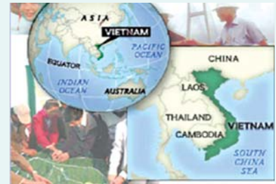
Harmonised Progress Reporting Tool

The portfolio monitoring tool (PMT) is ready for trial as a beta-version - with MPI, MOF, MOT and MARD as well as Nghe An Province - during Q3 2006. A workshop of line agencies and 5 Banks was held on 10 July to review