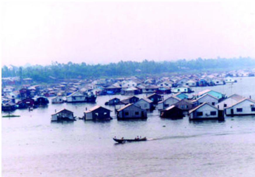
Fish cages village in Chau Doc - An Giang

lished to aim at strengthening capacity of coordination and information sharing among central and provincial levels with